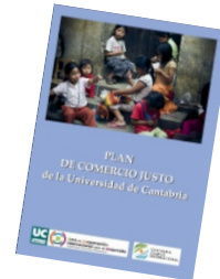
UC Fair Trade Plan