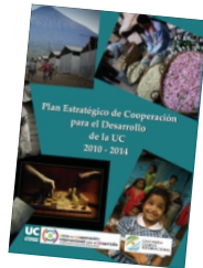
UC Strategic Plan for Development Cooperation